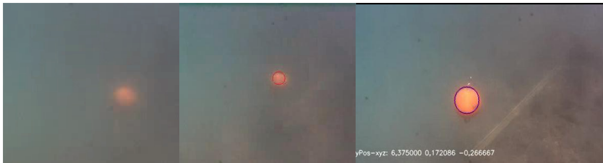
Figure 3b: SAUC-E 2011 Bremen's buoy servoing: detection, initial lock on it, final tracking and circling around it.