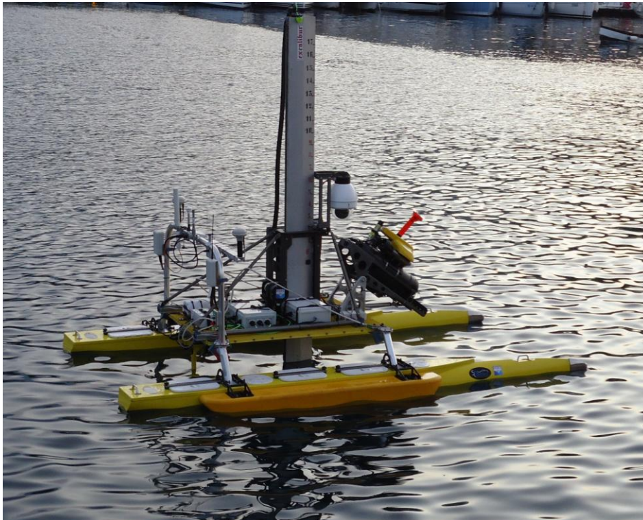
Figure 2: NURC's Autonomous Surface Vehicle (ASV)