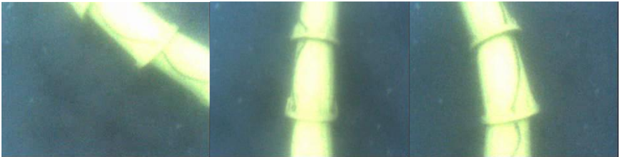
Figure 3a: SAUC-E 2011 Luebeck's pipeline following: detection, following the straight portion, and following the curved portion.